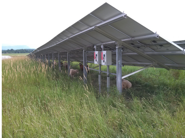
Forage and shade opportunities are good under Open View Farm's Solar Panels

sheep in the array during the hottest part of the summer and again in late fall. The panels provide a huge amount of shade, which the sheep appreciate and the array provides a stockpile of feed when other areas of the farm are being hayed. We also use the array as a secure place for the sheep to be on the rare occasions that we leave the farm to a sitter ”.