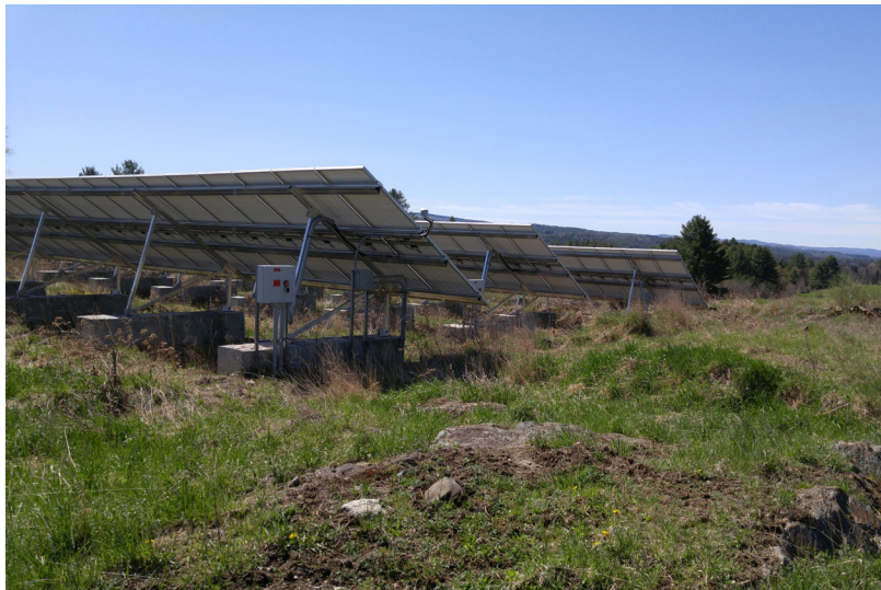
Solar array in the buffer zone at the McKnight Farm

The overlapping requirements of the solar property tax exemption and the current use program provide a twist – please review the details on page 2 of the Tax Department’s Technical Bulletin TB-69. It can be found here: http://tax.vermont.gov/research-and-reports/legal-library/technical-bulletins , and more general information on the current use program can be found here: http://tax.vermont.gov/property-owners/current-use , including removing your property from current use and paying the land-use-change tax.