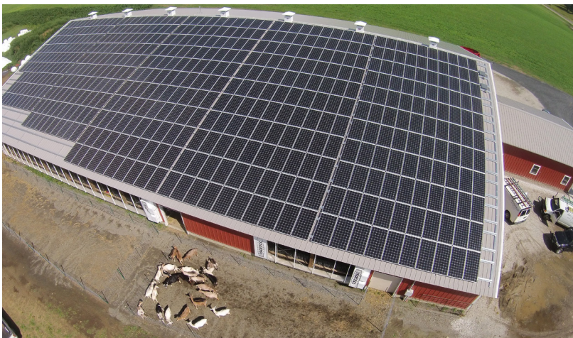
A 150kW system with 572 solar panels, utilizing a south facing roof on the Ayers Brook Goat Dairy in Randolph, VT.

Finally, as is illustrated in the case studies on the next few pages, farming-friendly solar is possible. In our examples, several