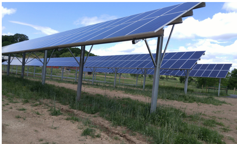
Still to be seeded down before cows come- Maple Ridge Meat

on, he will use the area for yearlings to graze. The animals are smaller, so that will help in handling them while learning how to manage cattle within the solar array.